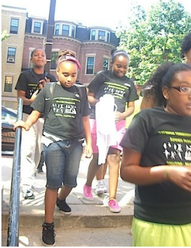
WE ARRIVE AT FAB LAB